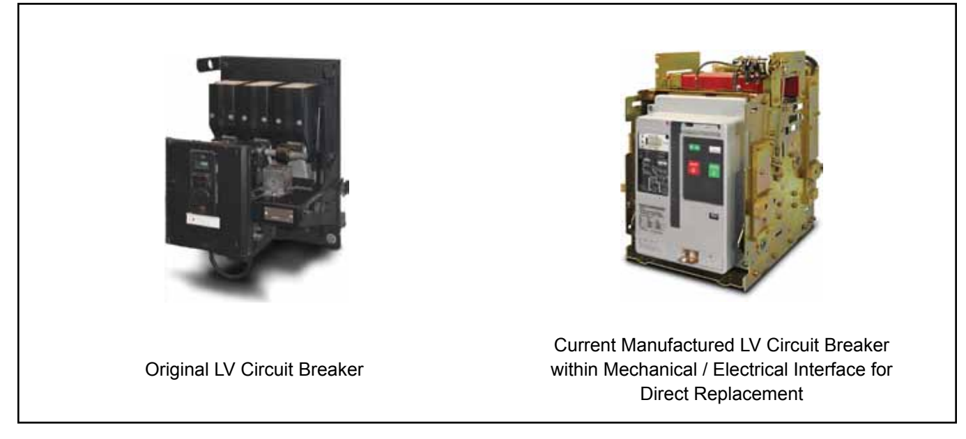
Figure 1. Power Equipment—480V Circuit Breaker Upgrade Option