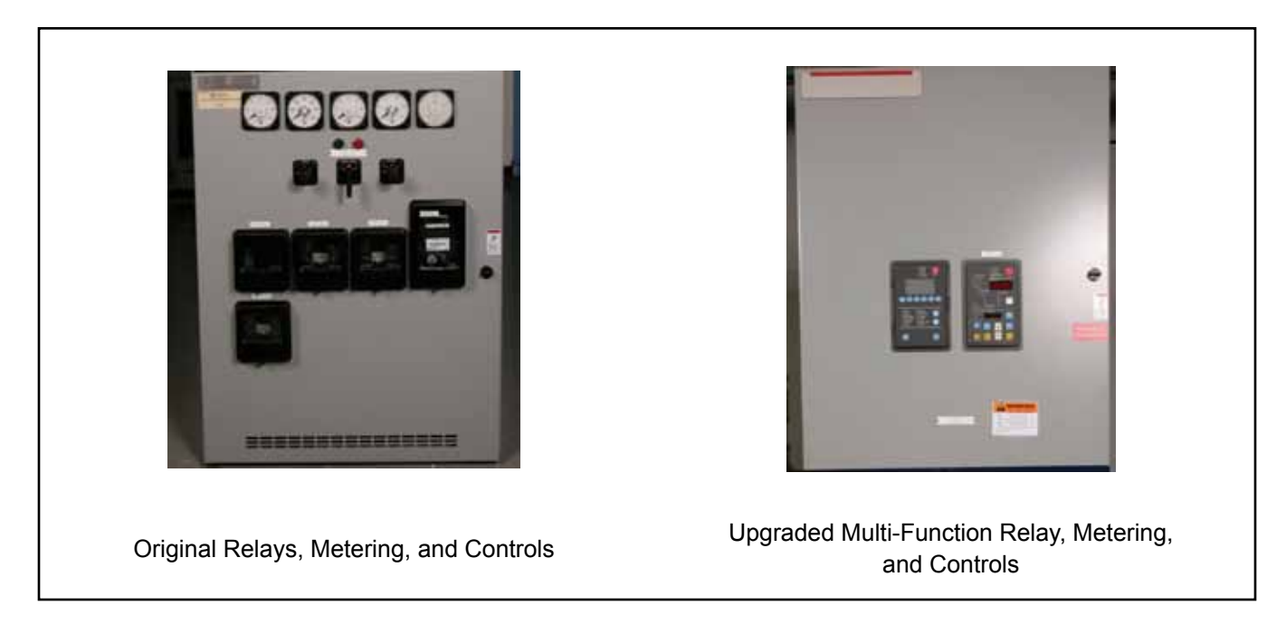
Figure 3. Power Equipment—Protective Relay, Metering, and Controls Upgrade Option