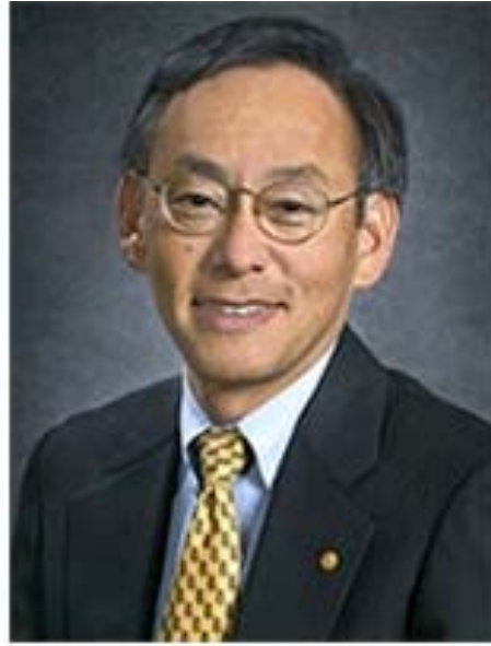
Steven Chu Secretary of Energy